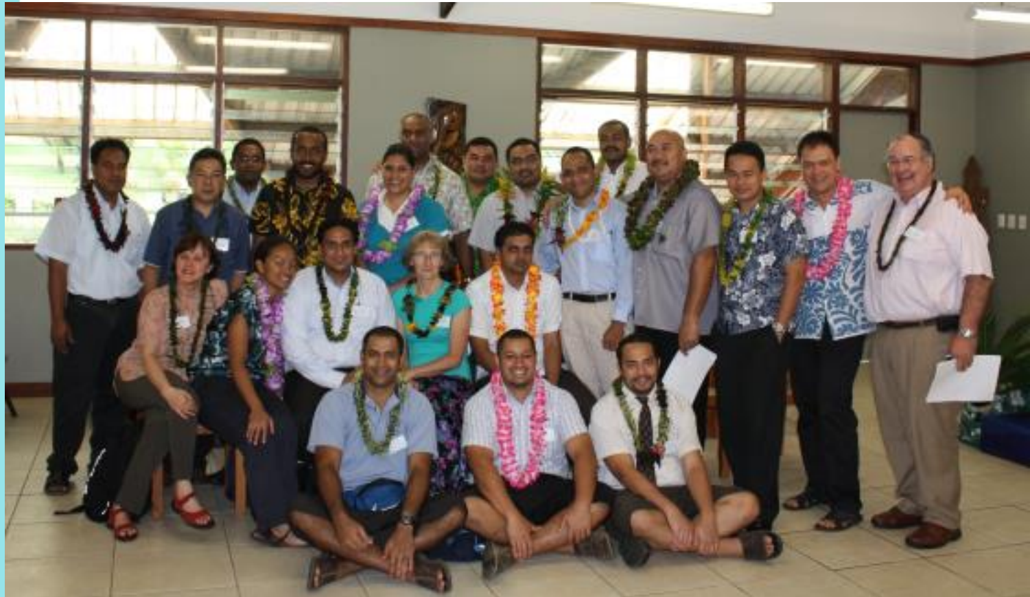
PISA Meeting 2010-Vanuatu