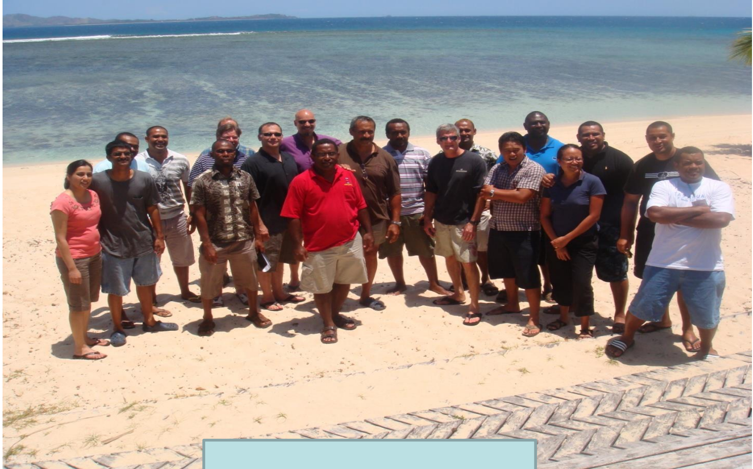
Tavarua Hand Workshop